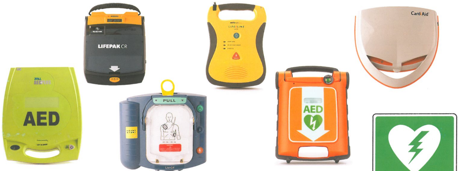
*Please note, the above is just a selection of AEDs available. There are various other models on the market.

Delivering the right care, at the right time, in the right place